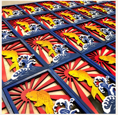
Hack Piece Studio - Wood piece painting