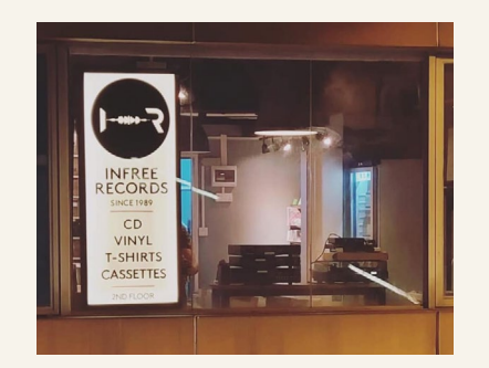
Infree Records - LED light box