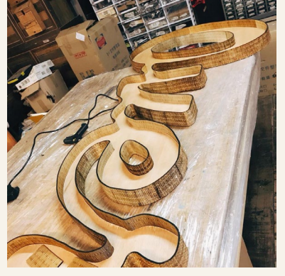
Overlab Shop - Shop Sign