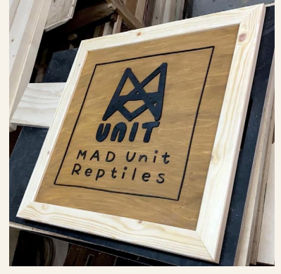
MAD Unit Reptiles Pet Shop - Shop Sign