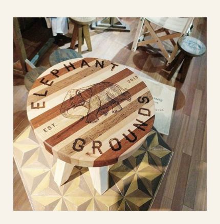
Overlab Shop - Shop Sign